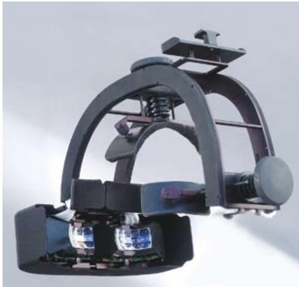
The lightweight piSight head-mounted display offers a wide field-of-view with multiple screens per eye to allow for more realistic visual experiences.

applications in which users need to see the virtual world and reality simultaneously.