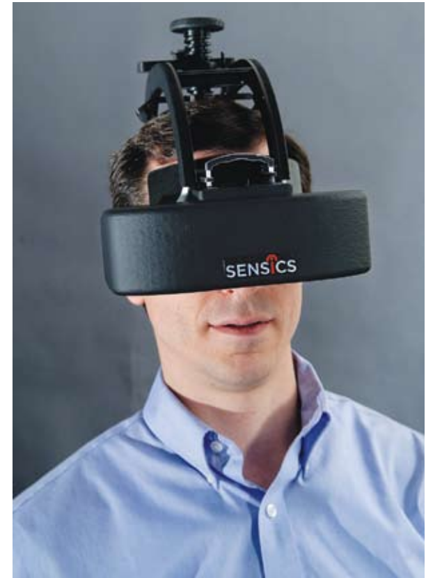
The piSight can be used with Linux or Windows virtual reality software, and can be controlled via motion trackers or joysticks.

Commercial applications for the piSight are only limited by customers' imaginations. "Customers have been selecting the piSight systems for a variety of simulation, training, design, and research applications," says Brown. An automobile designer uses the HMD to "sit" in the driver's seat of an automobile and explore the design in a realistic, immersive experience before production begins. Other companies are beginning to use the piSight for training purposes that involve learning specific