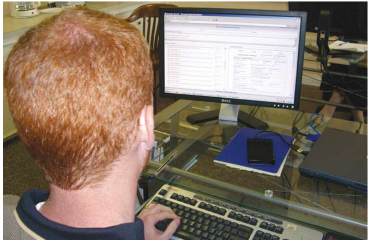
Knowledge-Based Systems Inc.'s AIOXFinder is an ideal search engine for sharing information in multisystem computer application environments.

The company also created the Toolkit for Enabling Adaptive Modeling and Simulation (TEAMS), through another Kennedy SBIR, which later, through a Phase III contract, evolved into the TEAMS+, a real-time operational analysis software that helps develop, maintain,