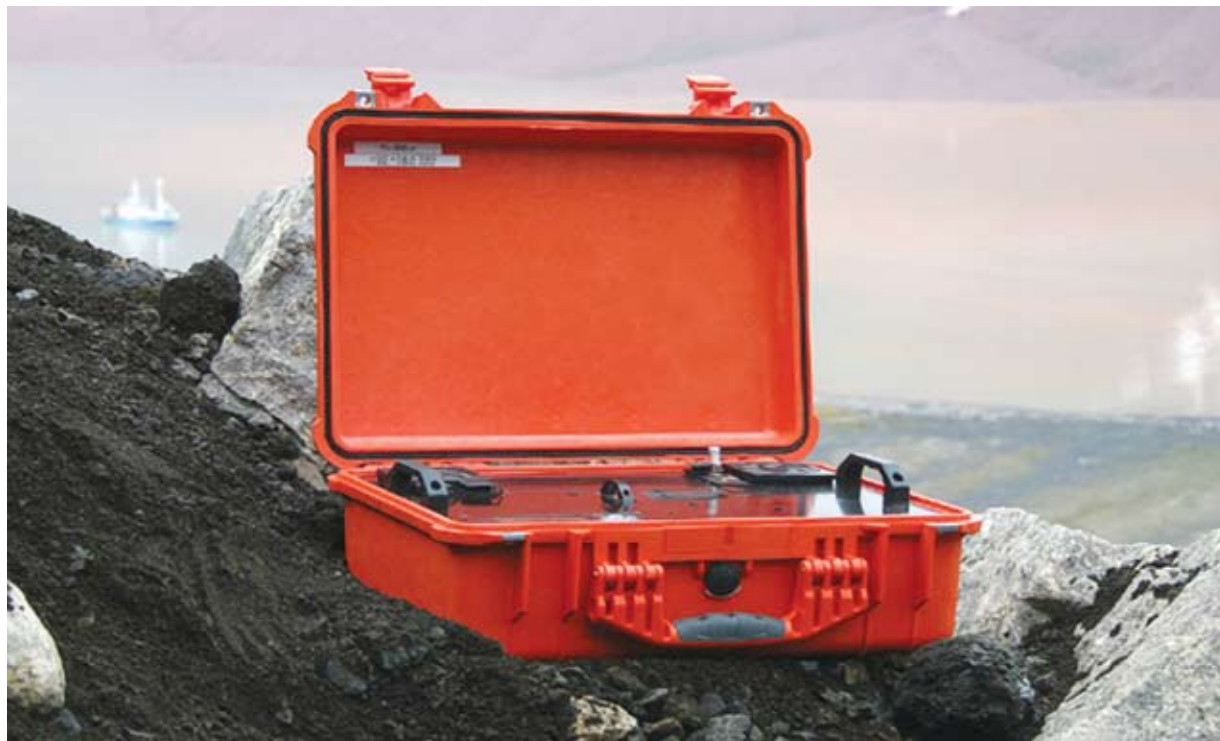
inXitu's portable rock and mineral analysis device was tested at the Mars Analog site in Spitsbergen, Norway.

inXitu's Terra product is the first truly portable XRD/XRF system designed specifically for rock and mineral analysis. XRD is the most definitive technique to accurately determine the mineralogical composition of rocks and soils. Phase identification is obtained by comparing the diffraction signature of a sample with a database of XRD mineral patterns. The addition of XRF informs on the nature of the chemical elements in the