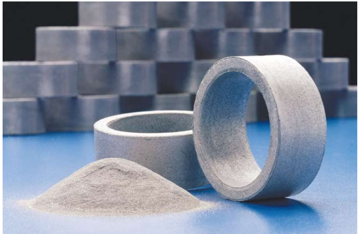
The "R&D 100" award-winning DMBZ-15 high-temperature polyimide.

vehicles, which encounter elevated temperatures during launch and reentry. Other applications include use with chopped fibers to make bushings and bearings for engine or oil drilling components, and in high-temperature coating and ink applications. The light weight of DMBZ-15 polyimide composites invites use in secondary, non-load bearing aircraft engine components such as vent tubes, nozzle flaps and bushings, as well as for oil drilling components. Lightweight polymer composites also offer significant weight savings and subsequent improvements in fuel efficiency in aerospace propulsion and automotive applications. ♦