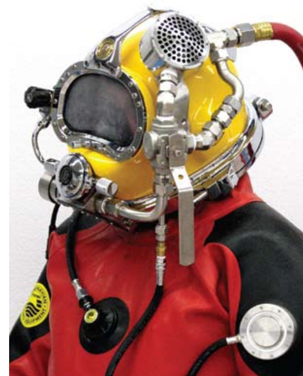
The specially designed suits provide deep-sea divers with space suit-like protection.

MacCallum says, “Bringing space technology back to Earth, we provide space suit-like protection for divers working in hazardous environments ranging from chemical and biological warfare agents, to the toxic environment of a shipwreck or chemical spill. Conversely, our technology is now being considered as a way to protect municipal water supplies from being contaminated by divers servicing potable water tanks.” ❖